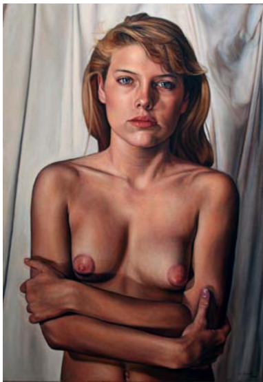
Stephen Cornelius Roberts Untitled, 1989 Oil on canvas 60 x 42 in. 152 x 107 cm