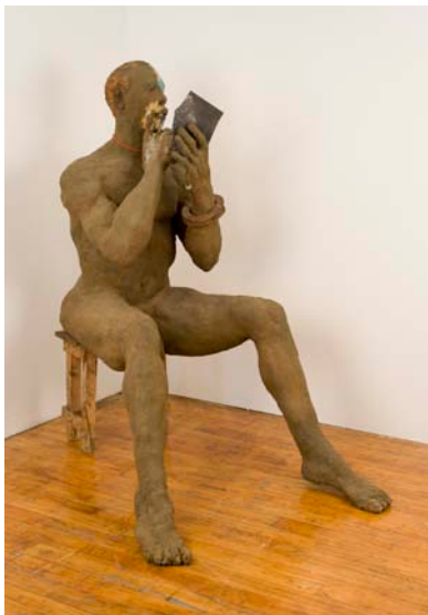
Ousmane Sow Untitled ( Nouba Series ), 1984-87 Mixed mediums, pigment, straw and jute over an armature of metal, with iron, mirror and wood stool 66 x 40 x 50 in. 168 x 102 x 127 cm